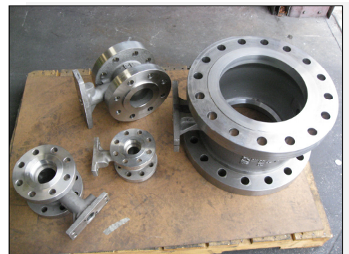
Segmented Ball Valve

Our operations conducted under strict policies of ISO 9001:2008 certified Quality Management System.